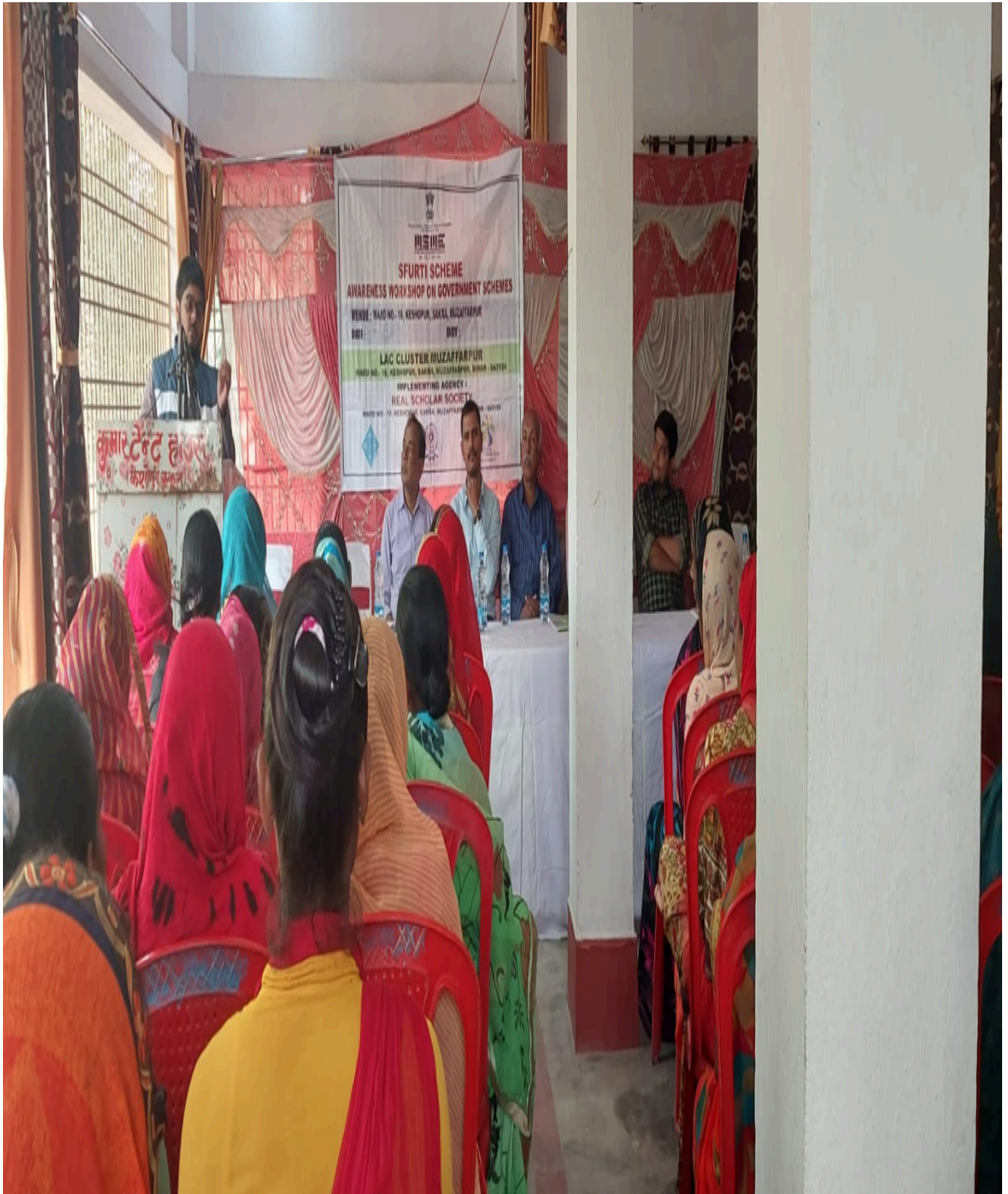
Awareness program regarding Government schemes as a part of our soft intervention activity conducted at CFC.