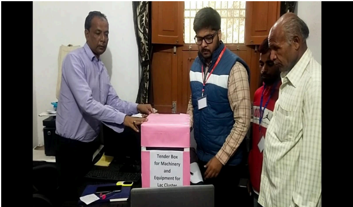
Tender procedure conducted for machinery equipment at lac cluster premise.