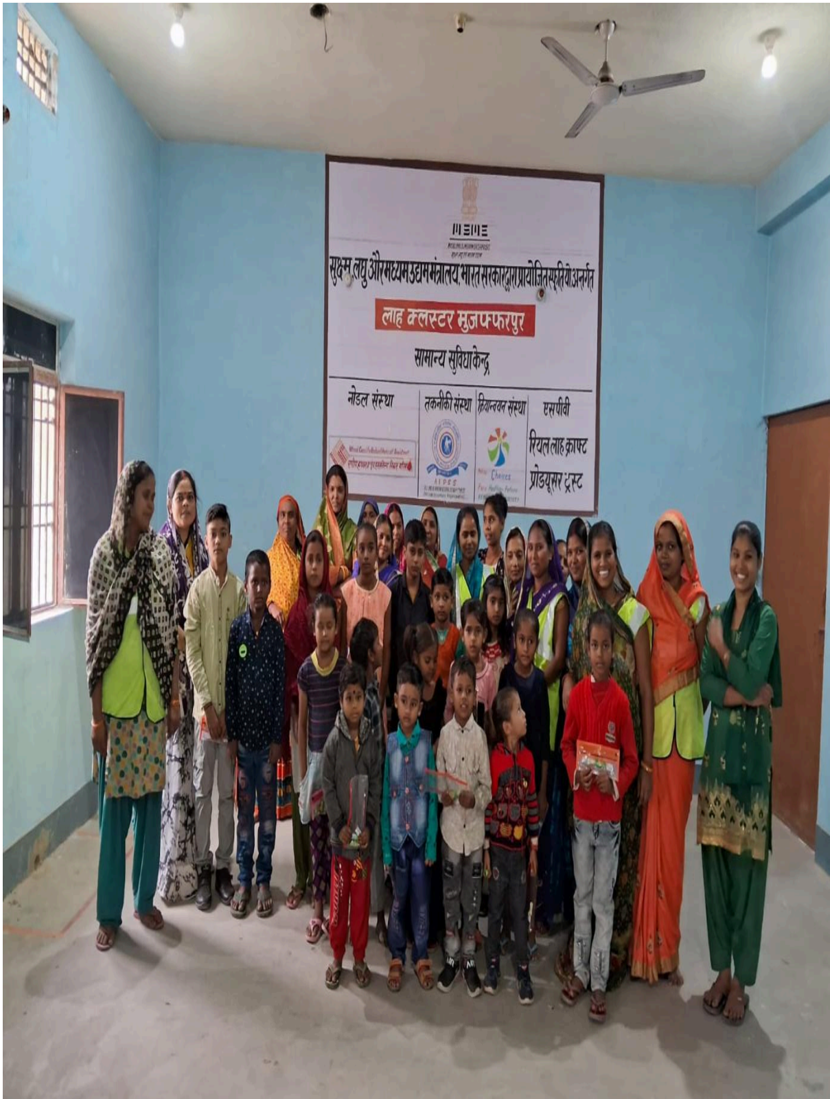
Children Day celebrated at CFC premise with our artisans children on the birthday eve of our first Prime Minister Jawaharlal Nehru