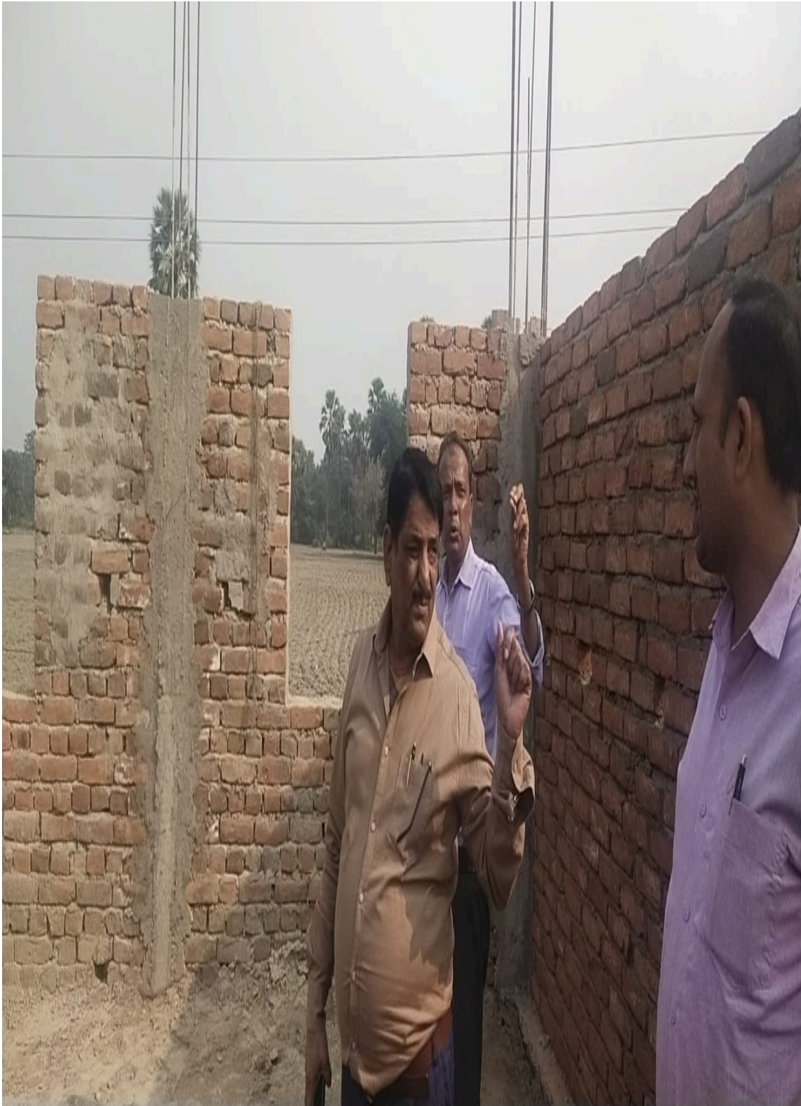
Foundation work of CFC construction at Keshopur earlier initial phase of the CFC. Visit of GM DIC along with his colleague to check the progress of our cluster.