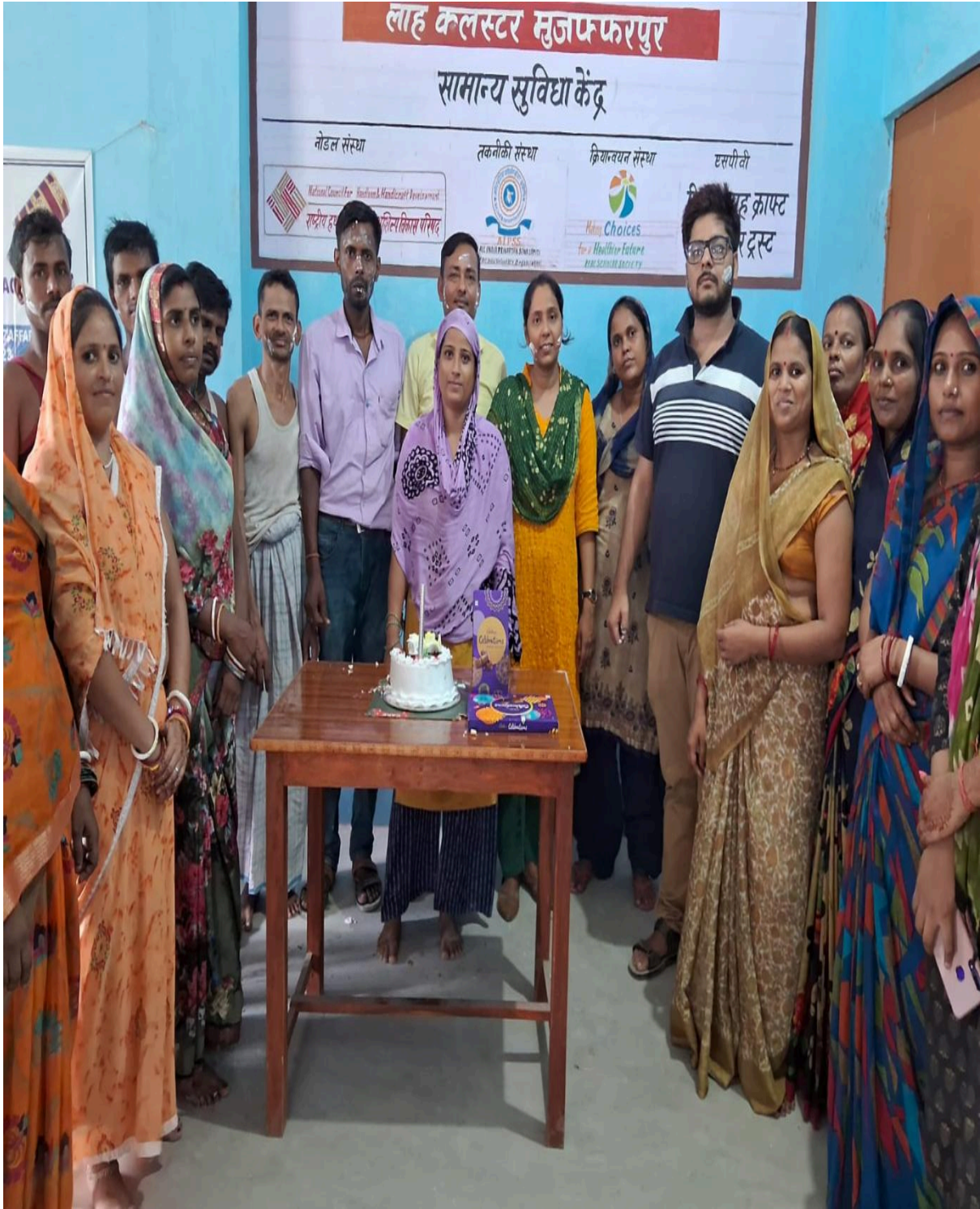
Celebration of Teacher's Day on the eve of birthday of our first vice president Dr Sarvapalli Radhakrishnan with our artisans on 5th September 2023.