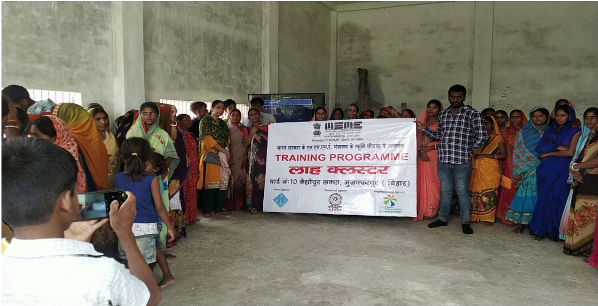
Training program conducted with the artisans.