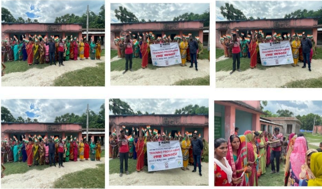
Independence day celebration with our artisans.