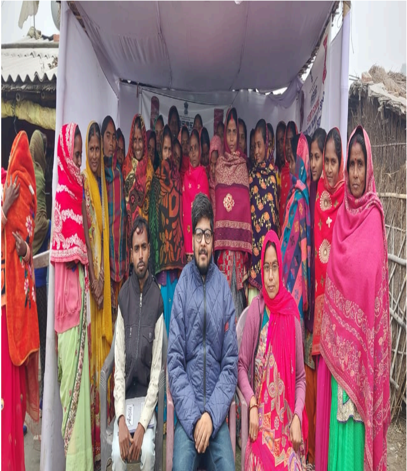
Completion of Skill up gradation training 4 week with our artisans .