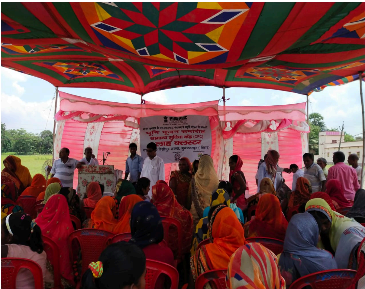
Bhoomi puja samaroh at our CFC premise