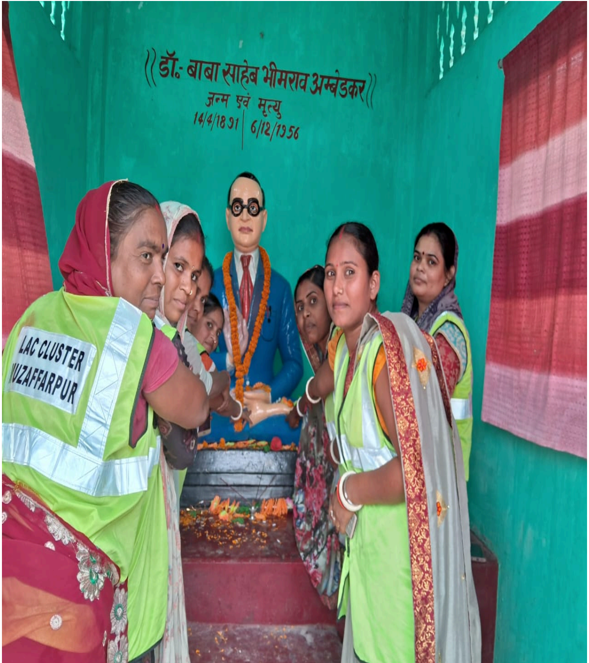
Birthday anniversary was celebrated of our First law minister and chairman of Drafting committee Dr BR Ambedkar at Ambedkar nearby our CFC premise at Keshopur.