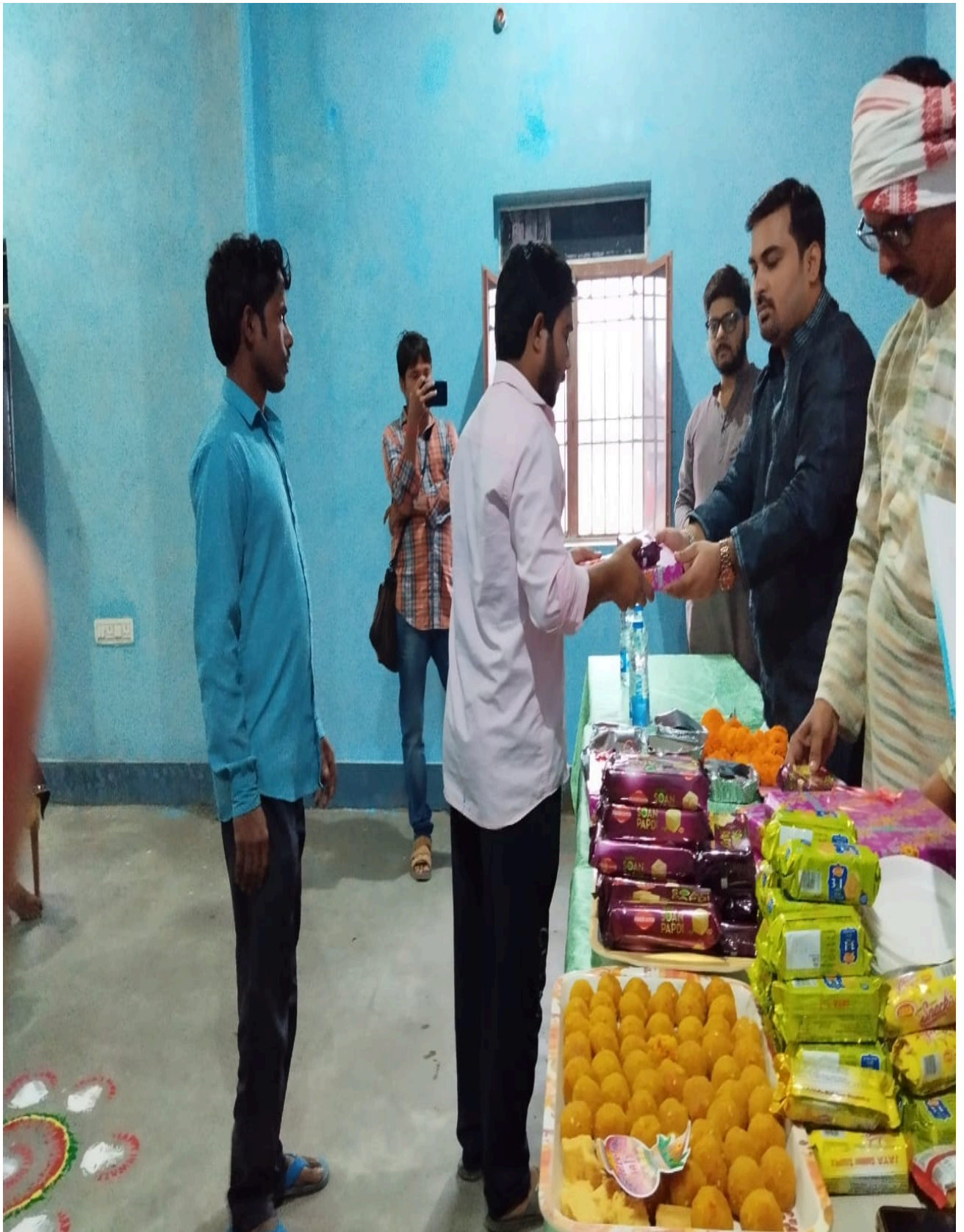
Diwali celebration conducted for our artisans at CFC where gifts, sweets were distributed in the presence of esteemed guest.