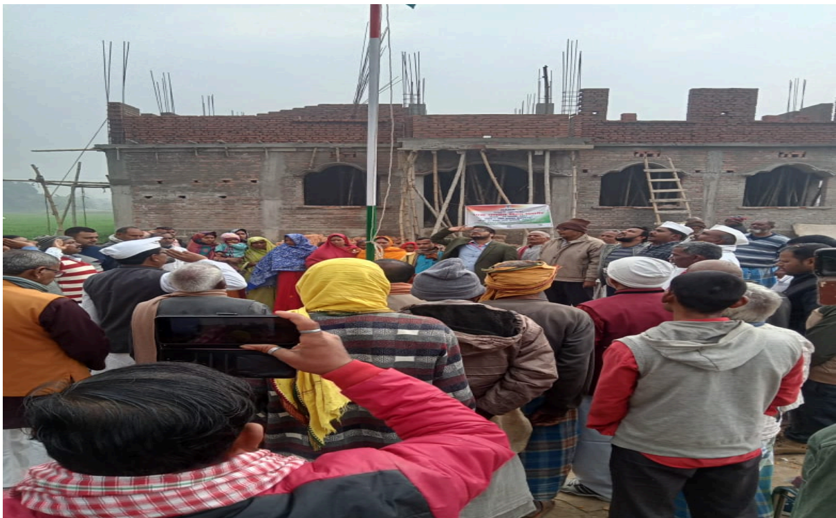
Celebration of Republic Day at our CFC and flag hoisting conducted at CFC premise on 26th January 2023.